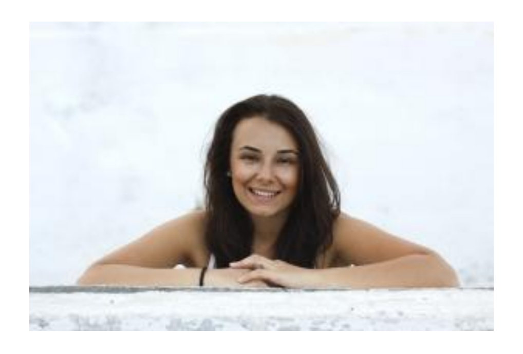
Self Help Lessons By Best Sellers What You Can Learn From The 10 Best Self Help Books Of Our Time

Self-help is a very important aspect in life that needs your attention. With this, facing the challenges in life and reaching out for your success will be more possible than before. Find out everything you need here.